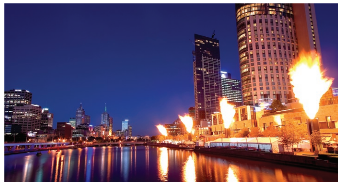
Crown Casino joined the Melbourne trials December 2007

The Melbourne trial will run for 18 months, during which time 90 venues will experience the BottleCycler service for 2 months without charge. Sydney will follow early 2008.