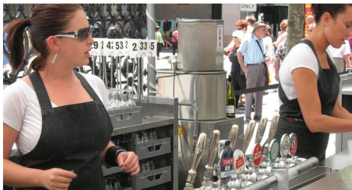
Summer has started. Quay Bar, Sydney

Thanks go to recent participants: Pure, The Greyhound, Mercure Hotel, Collins Quarter, Cubby House, Box Hill Tafe, The Australian Club, E.T.'s, Fox in the Box, Gin Palace, Citigate, Crown Casino, Kent Hotel, Qantas Catering, Sabel, Shamiana Restaurant, The Local, Crown Plaza, Three One Two, Wed on Wellington, Dreams Club, The Rooftop Bar, The Old Melbourne Gaol, Eurotrash, Billboard, Tramp Niteclub, Red Spice Road and Mynt Lounge.